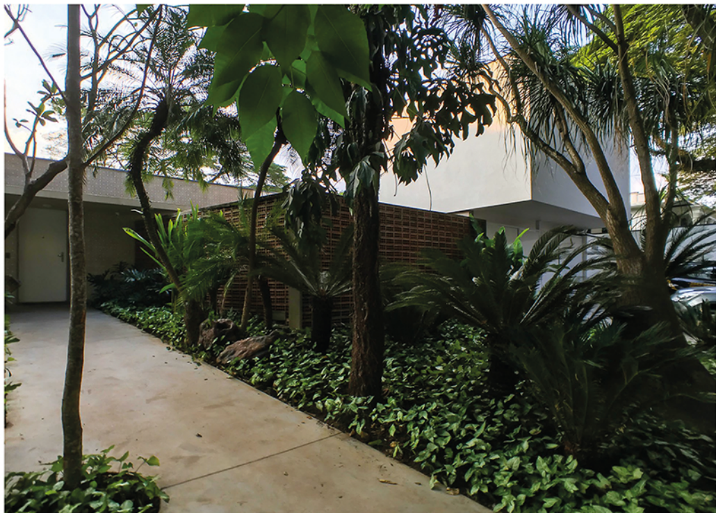
Front garden and façade

The intense research through the original drawings and local prospection fed the proposed design developed with expertise for the building techniques, colours, finishing and coatings. Those punctual interventions were cared with precise criteria following the guidelines and rules of national and international institutions.